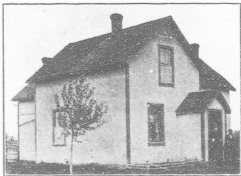
School at Encampment, Prince Albert