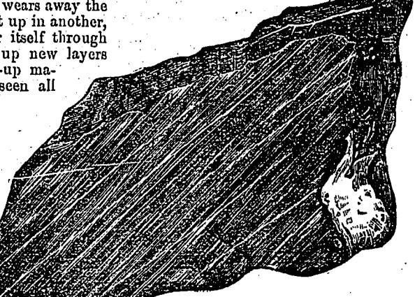
FIG. 1.-ROCK SCRATCHED BY GLACIER. (From Lycll's "Elements of Geology.")

caught in its meshes. When you squeeze it you press out the air and bring the ice particles near enough together for them to freeze solid. A tiny little bit of water added runs in between the particles of ice and pushes the air out before t, and so helps to make it solid ; and when the water too is squeezed out, makes it freeze. Too much is worse than none at all. Each winter's weight of snow lies during the cold weather without doing much, but when the summer warmth begins to soften the snow, it begins to pack, as the moist snowball does, and being a little softened, and pressed by the weight above, to push its way down through some valley. It is hindered in its travels, and being pushed banks were. (Fig. 2.) behind and hindered in front, it packs In the picture you see a tighter and tighter till we find it, farther down in its bed, a mass of ice. The weight is getting greater and greater behind it with each winter's load of mow, and so the ice is forced down, no matter what is in the way, and the valley is finally filled with the moving river of ice.