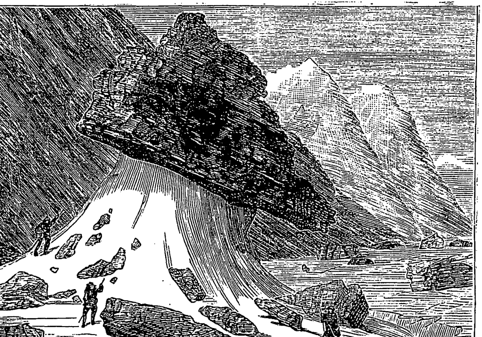
FIG. 3.-TRANSPORTATION OF ROCKS BY GLACIERS.

These glacier signs are very important in studying what the Ice King has done in bringing the earth to its present state. Long