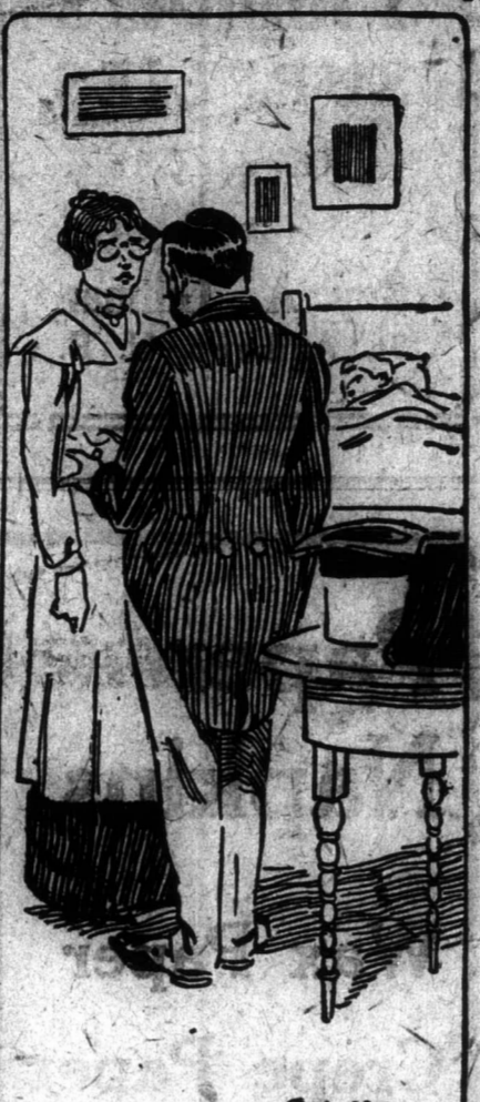
"I shall always believe in mustard plasters—mustard plasters and hot water bags."