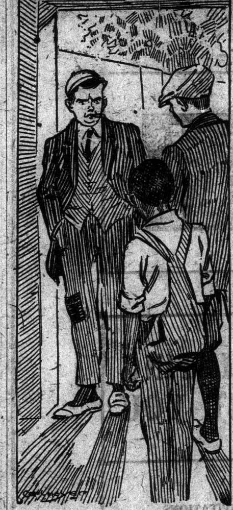
The Fat Faced Boy Appeared Upon the Threshold and Gazed Coldly About.

"Pah! It didn't hurt me, did it, Rupe? Come on in, Rupe; show this baby where he's got a wart on his finger."