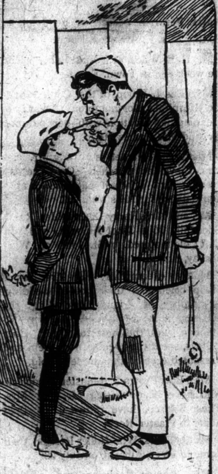
"You understand that, 'bo?"