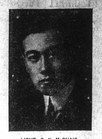
of the 5th Royal Highlanders

Quotations furnished by J. C. Mackintosh & Co Members Montreal Stock Exchange, Exchange Build-