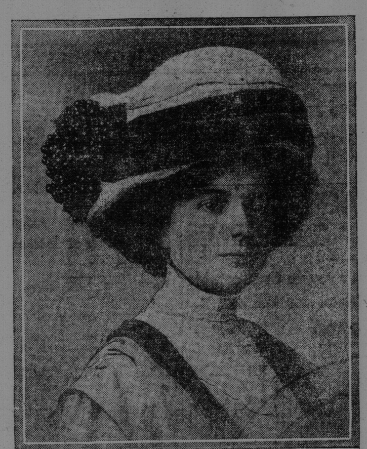
A SMART BLACK AND WHITE TURBAN.

The large turbans are much worn for traveling and motoring, for a veil is easily draped over such a hat. This white straw turban is made from a big plate eau of rough white straw caught loosely to a mushroom frame. Black velvet ribbon surrounds the hat near the edge of the brim, and at the right side is a cabochon of black grapes set in vivid green leaves.