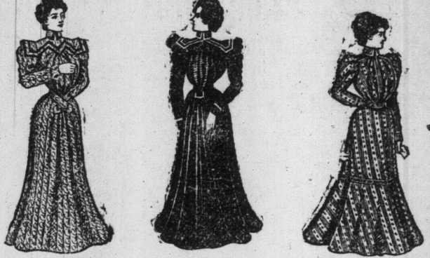
No. 1515. No. 1514—Ladies' Fine Wrappers, made of English eider-

No. 1512—Ladies' Stylish Wrappers, made of choice fancy printed flannelettes, frill around yoke, trimmed with satin ribbon, deep flounce on skirt, waist 2.50