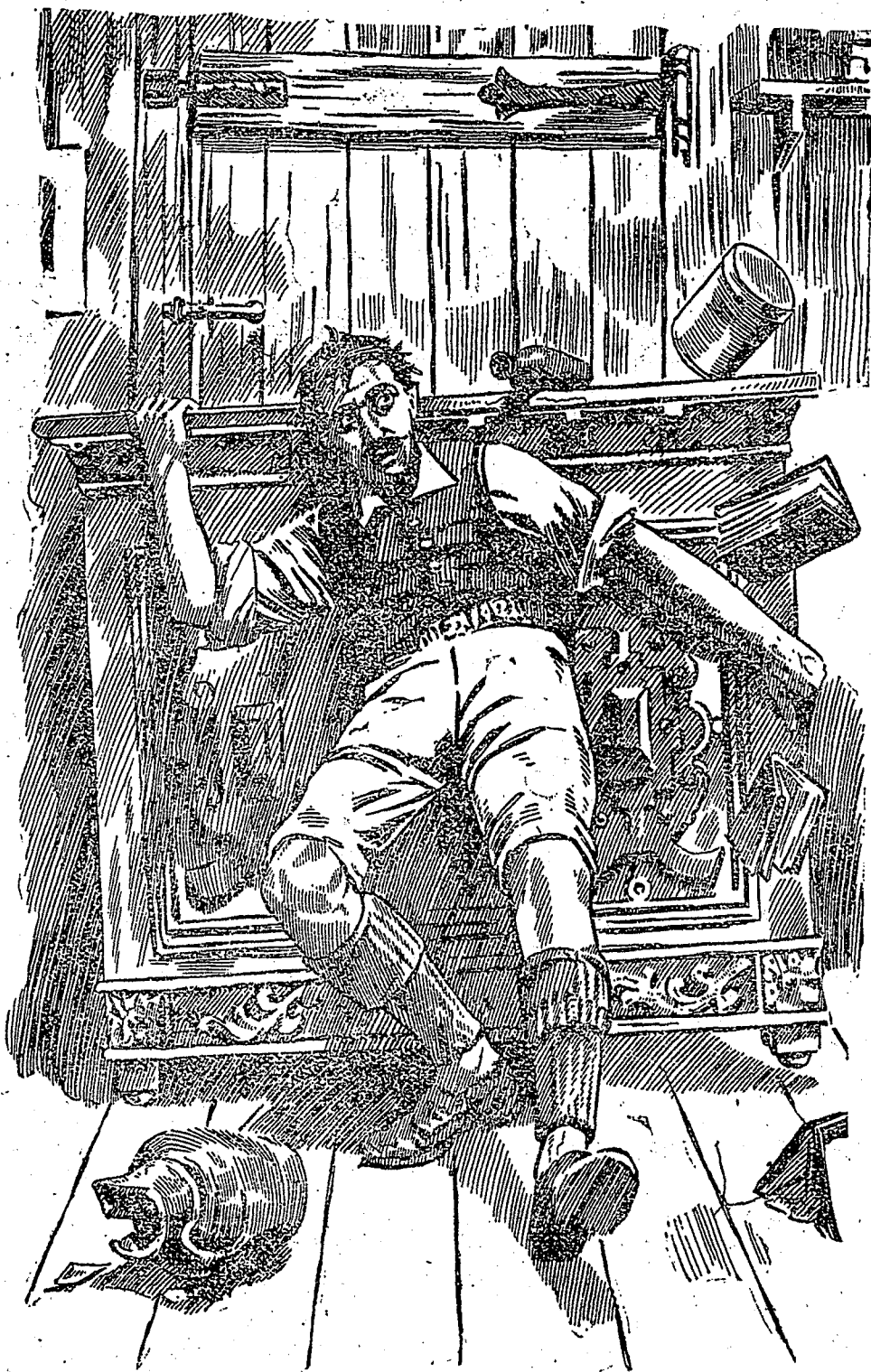
THE DOOR THE YOUNG GUIDE JAMMED WITH A HEAVY DRESSER