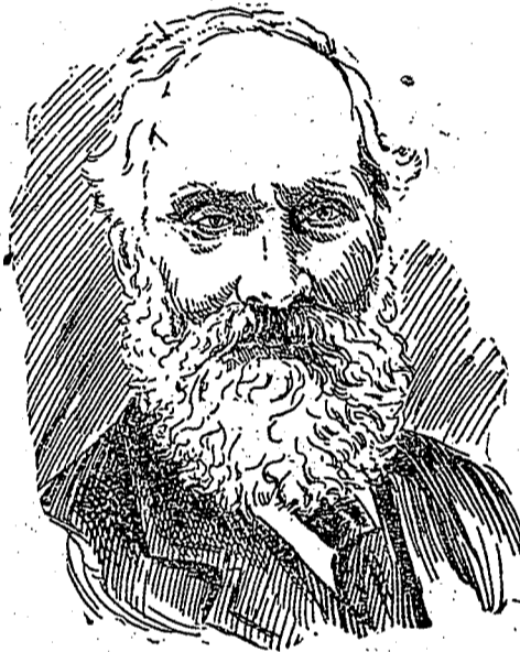
SIR WILLIAM THOMPSON (LORD KELVIN.)

Lord Kelvin’s mind is a marvel of brilliancy. One who knows him well, says:—