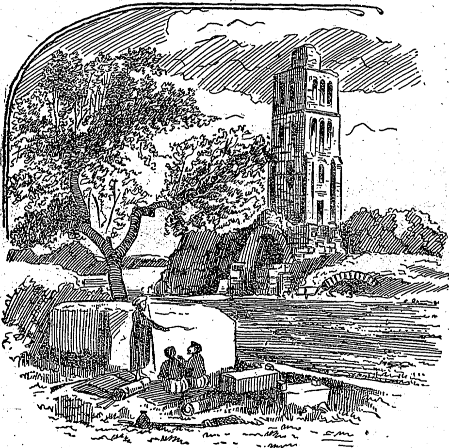
A FAMOUS TOWER.

The following story comes from Waterloo, Ia.:—The members of the Presbyterian church decided to erect a new place of worship. Stone was scarce; in fact, there were no quarries and no rock suitable for building purposes nigh at hand. At last their attention was called to what was apparently a large boulder which stood in the middle of a plain about eight miles from the town. The huge mass of rock was like an island in the midst of a vast sea. About eight feet of it projected above ground. The work of excavating this gigantic boulder was at once begun. When exposed to view it was found to be 23 feet