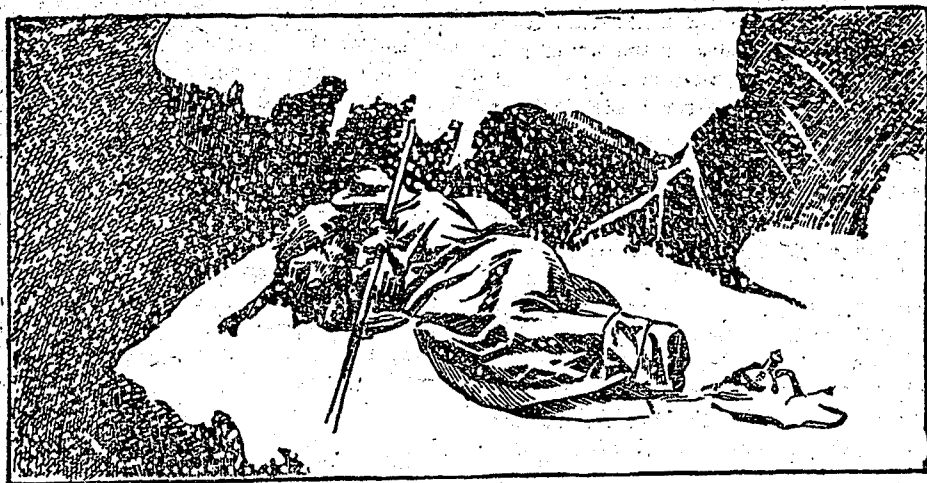
HE MADE OUT THE FIGURE OF A MAN.