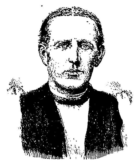
THE BISHOP OF HONDURAS

teen and fifteen, who hardly know the reason nances, their eyes swollen from shedding tears. They are glad to find a dark corner where they : she must never take part in family feasts. A man or woman thinks it unlucky to behold a midow's face before seeing any other object in The relations and neighbors of the morning. the young widow's husband are always ready to call her bad names. There is scarcely a day of her life on which she is not cursed by these people as the cause of their beloved friend's In addition to all this, the young She is closely confined to the house, forbidden even to associate with her female friends. Her life, then, destitute, as it is, of the least literary knowledge, void of all hope, empty of