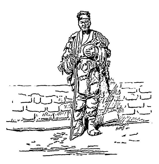
A CHINESE BEGGAR.

down the flapping sails. Sam was hauling in a rope when the wind veered round and caught the sail to which it was fastened; the rope whirled out with mighty force, caught Sam's arm, and in a moment he was struggling in the water.