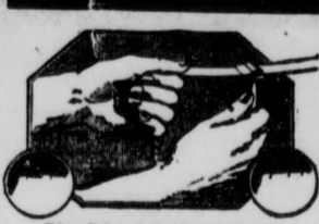
Edge Before and After Stropping (Magnified).

You can procure Dr. Williams' Pink Pills through any dealer in medicine or they will be sent you by mail at 50 cents a box or six boxes for $2.50 by writing direct to The Dr. Williams' Medicine Co., Brockville, Ont.