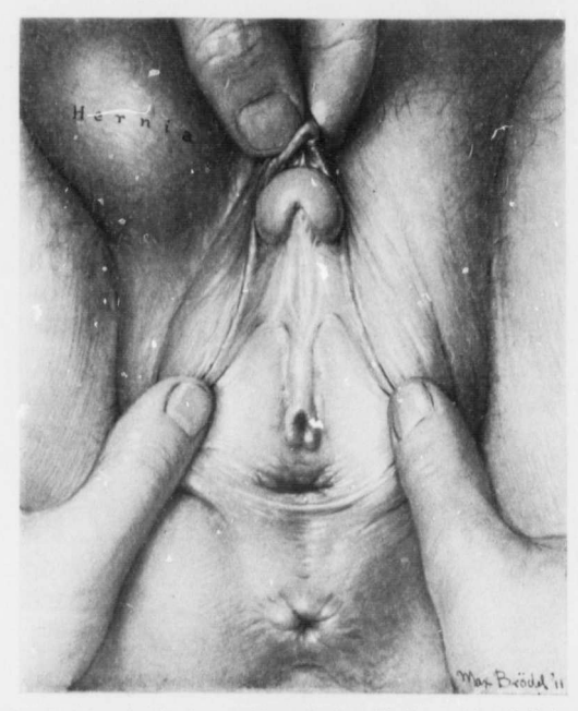
. Fig. 2 The imperfectly formed urethra in a pseudohermaphrodite. The glans penis is perfectly formed in its upper portion and above is provided with a rudimentary prepuce formed by the labia. The penile portion of the urethra is recognized in part as a groove, in part as a ridge. The urethral orifice is of the female type and is freely patulous to the bladder. The vagina is 1½ inches deep and ends in a blind pocket. There is no evidence of a cervix.

of spermatozoa. The stroma of the testicle was increased in amount.