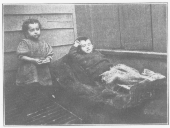
SUFFER THE LITTLE CHILDREN TO COME UNTO ME.

whole of the family life. Reading Rooms; Night Schools, for men and women; Sewing Classes for women and girls; Sabbath School; Boys' Club and Manual Training; Boy Scouts; Nursery; Tract Distribution; Gospel Services; Bible Classes; Open Air Services; Free Dispensary; Systematic visitation of houses, shops, Hospitals and other institutions; dealing with individuals; en-