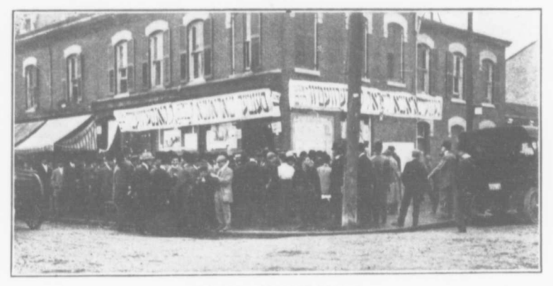
POLITICS IN THE WARD.

tion, in no other part in the whole of Canada, was the contest more real and fierce, than amongst the Jews in St. John's Ward. For weeks before the election, night after night all the available meeting places were taxed to the utmost capacity with keen fighters, who took every possible opportunity to gain advantage over their rivals. All kinds of promises were made to the supposed electors, who had votes and who had not. Some of the scenes witnessed defy description. In fact, every man, woman and child in the ward was a politician, and each