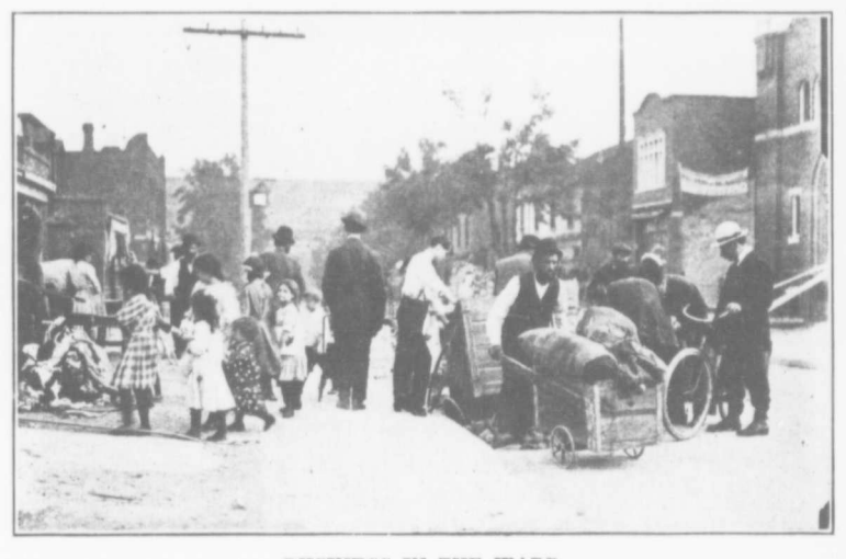
BUSINESS IN THE WARD.

We do not suggest that all is well with the Jew. "As is the Gentile, so is the Jew." All the social, economic