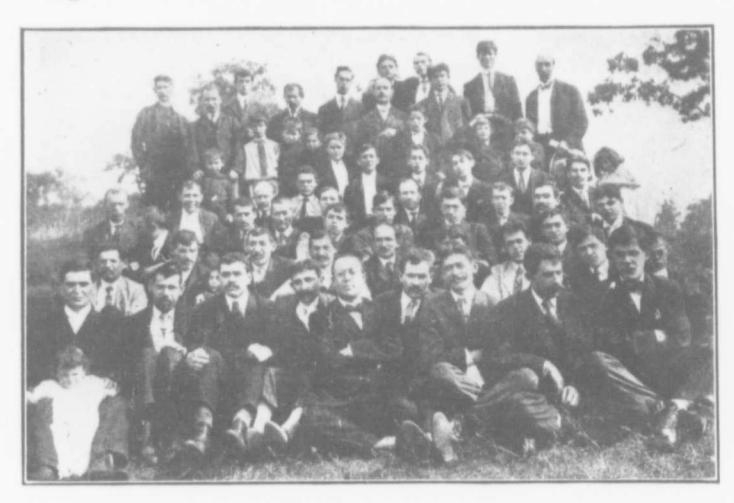
SEEKERS AFTER TRUTH.

In order to reach the Jewish people with the Message of Love, we must show them the reality of our