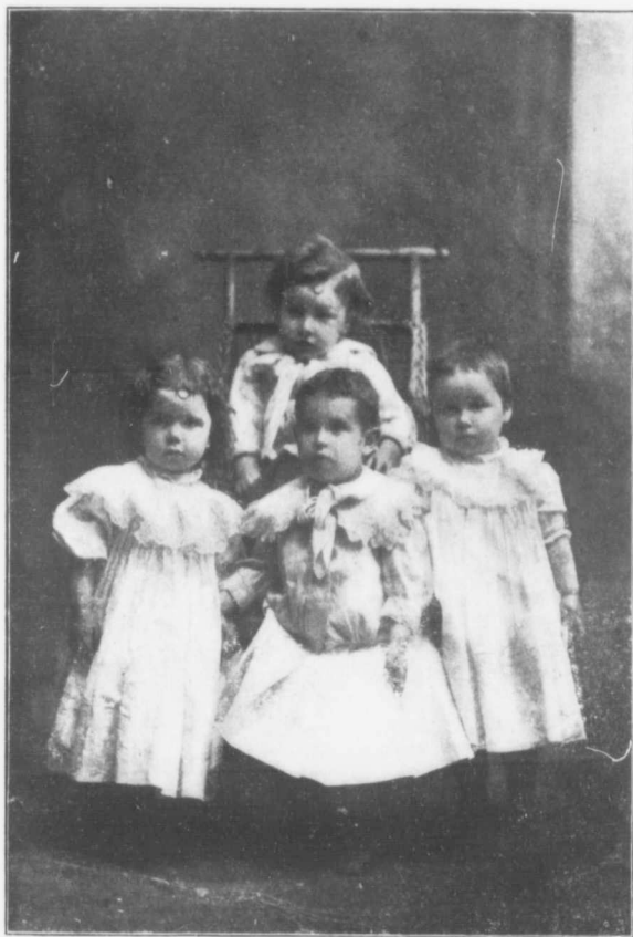
With Life All Before Them.