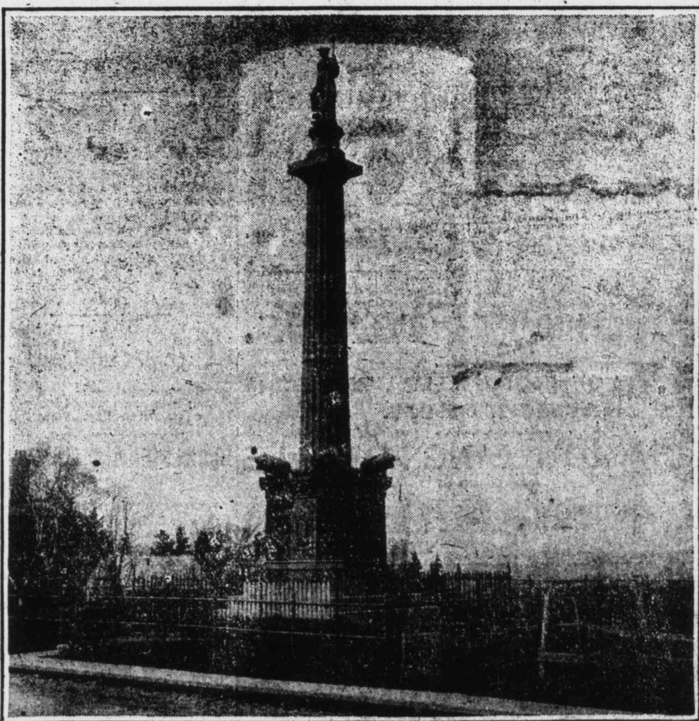
MONUMENT TO THE BRAVE ON THE PLAINS OF ABRAHAM.