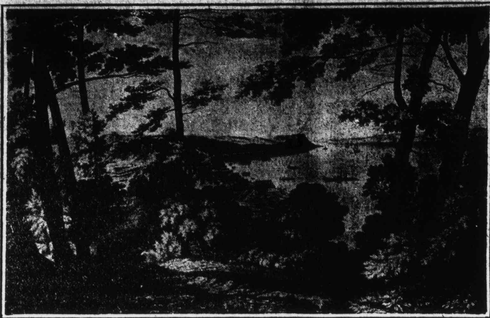
CAPE DIAMOND AND WOLF'S COVE.

For Infants and Children. The Kind You Have Always Bought Beware the Signature of Dr. J. C. Ayer