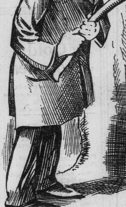
LA MINERVE IS DOWN.

But it is Expected the Old French Conservative Daily Will Soon be on Its Feet Again—Montreal News.