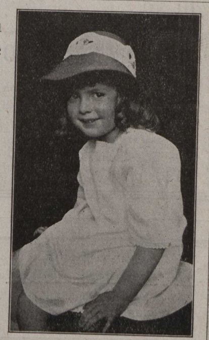
KODAK HOME PORTRAIT.