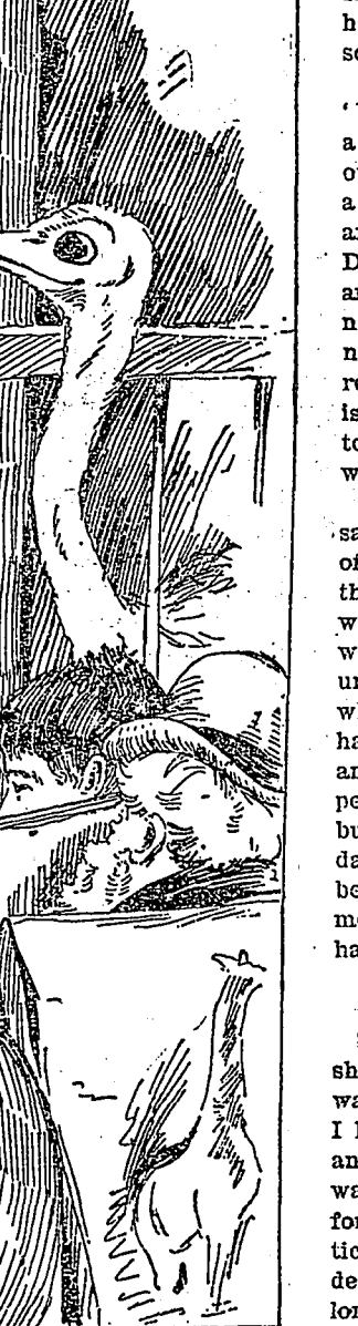
'A FULL LENGTH PORTRAIT, PLEASE! '- Home Words.'

What do you think of Harry, or shall we say, Dorothy? Have you good photographs of them? What do they think of you? Do they know you are kind and good to those who are weaker than you are, true to your word when it is easy-so easy-to tell an untruth, that you smile with good humor whenever you can? Do you think they have a full-length portrait of you-all true and good? Alas! none of us can have a perfect full-length portrait of our real selves. but we can try for it, and determine each. day that what we know is wrong and unbeautiful shall not spoil our characters. Remember the old proverb, 'Handsome is that handsome does.'-R. S., in 'Home Words.'