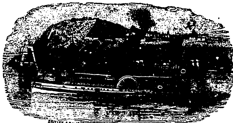
VIEW OF QUEBEC.