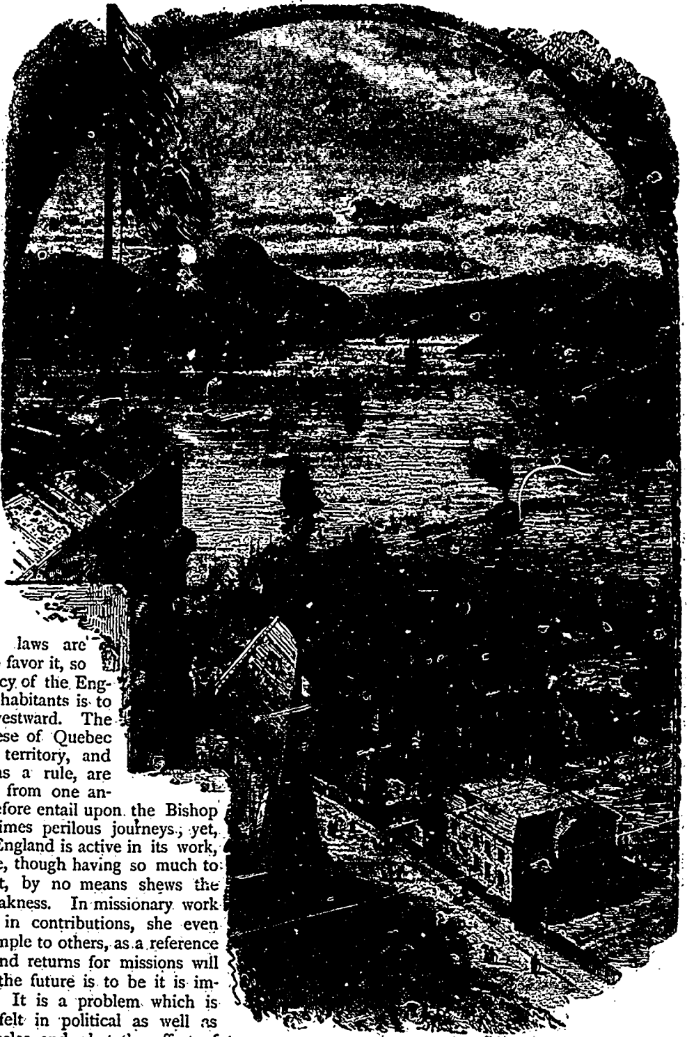
VIEW FROM THE CITADEL, QUEBEC, LOOKING DOWN THE ST. LAWRENCE.

The outlook for the future of the Diocese of Quebec, owing to the enormous French Roman Catholic population which it contains, is not as bright as that of the more western Dioceses. The whole country is under Roman Catholic rule, and the laws are largely made to favor it, so that the tendency of the English speaking inhabitants is to leave and go westward. The Anglican Diocese of Quebec covers a large territory, and the parishes, as a rule, are great distances from one another, and therefore entail upon the Bishop long and sometimes perilous journeys; yet, the Church of England is active in its work, and the Diocese, though having so much to contend against, by no means shews the least sign of weakness. In missionary work especially, and in contributions, she even sets a good example to others, as a reference to her reports and returns for missions will shew, but what the future is to be it is impossible to say. It is a problem which is making itself felt in political as well as ecclesiastical circles, and what the effect of having in this great Anglo Saxon Dominion an entirely different race, speaking an entirely different language, and bound closely together by interests of an exclusive and absorbing nature, is indeed difficult to foresee.