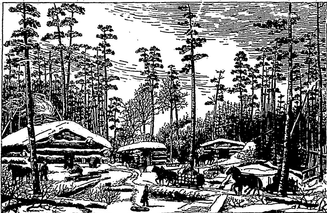
LUMBERING IN THE BACKWOODS.