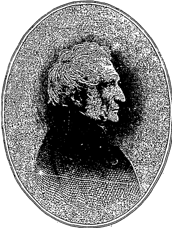
RT. REV. GEORGE JEHOSSHAPHAT MOUNTAIN, D.D., D.C.L.

After the American Revolution, the population of Canada or Quebec, which consisted of French Roman Catholics, a few perishing Indians, and some disbanded English soldiers and camp followers, became largely augmented by a population of an entirely different stamp. Loyalists who could no longer dwell within the American Republic, came with sad hearts to build up for themselves new homes in the more rugged regions of Nova Scotia and Quebec. But they brought with them their religion, and their religion demanded an