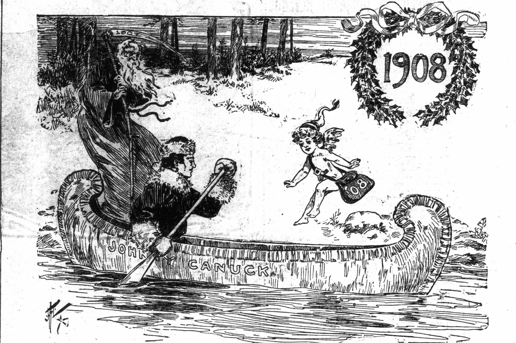
1907: "YOU'RE IN FOR A PRETTY SWIFT RIDE KID, BUT JOHNNY CANUCK WILL TAKE YOU THROUGH SAFELY."