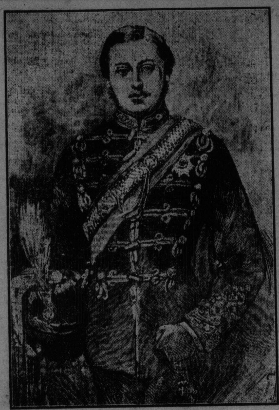
LATE KING WHEN IN ST. JOHN