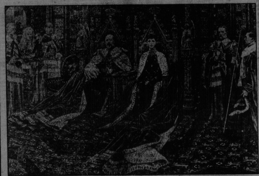
KING EDWAR AT OPENING OF HIS FIRST PARLIAMENT.

End Came Peacefully at 11.45 O'clock Last Evening In Presence of Members of Royal Family---Worry Over Threatening Political Situation Said to Have Hastened The Final Illness-Development of Pneumonia Following Severe Attack of Bronchitis Caused Death.