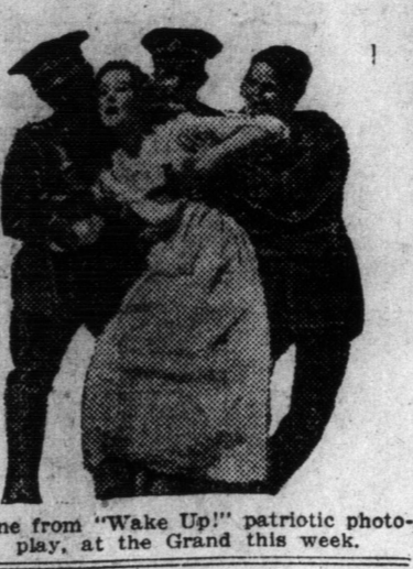
Scene from "Wake Up!" patriotic photograph, at the Grand this week.

It is impossible to believe that the temperance leaders actually contemplate the bringing on of an election at the present juncture. It is almost inconceivable, so inconceivable, in fact, that one cannot imagine the happening of such an event in this crisis of our Empire's life. Can you imagine the bringing on at the present time of an election contest upon a side issue in France or Italy or Britain?