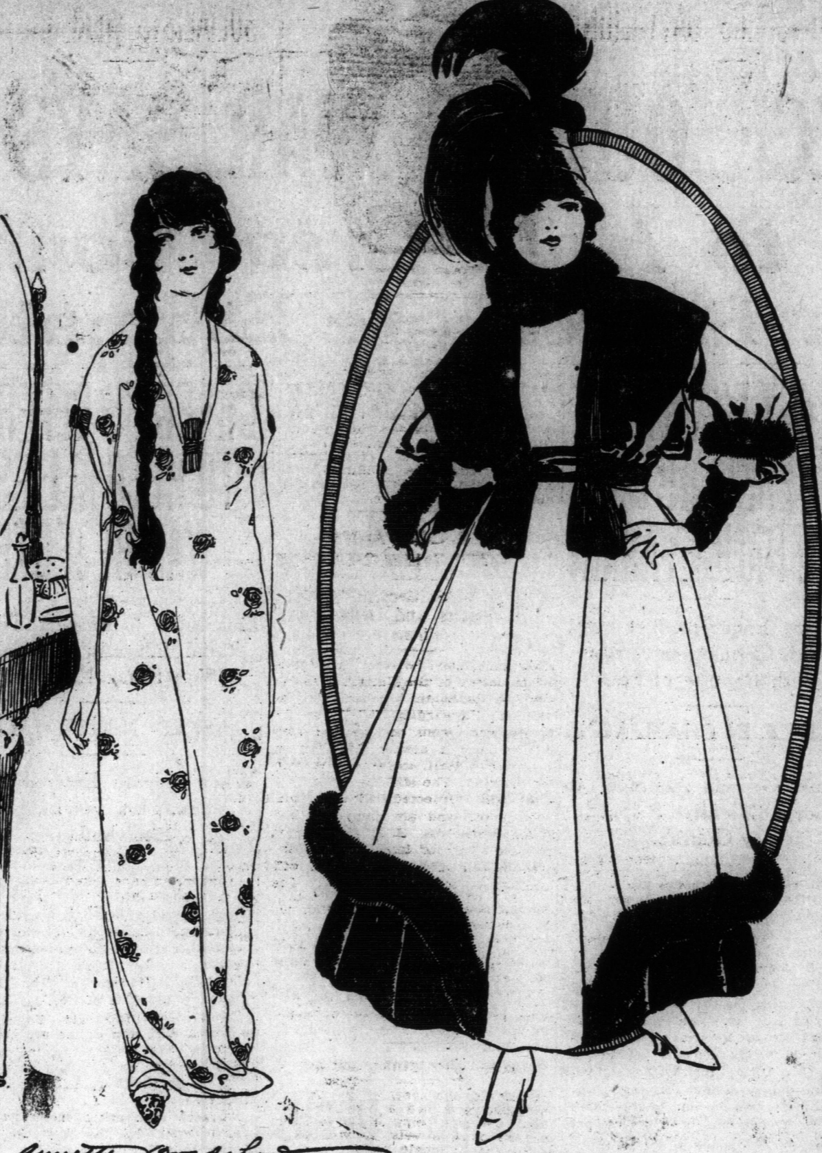
CLOTHES DO MAKE A DIFFERENCE Eight A. M. and Three P. M. in the Life of Fashion.