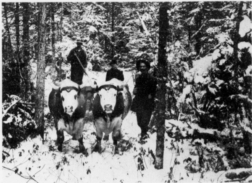
Logging with oxen near Bear River, Nova Scotia.