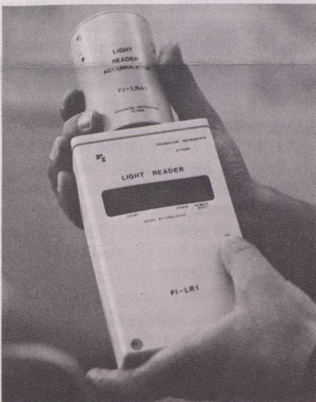
The meter designed and developed by the laboratory to record the number of hours lights are on in a room.