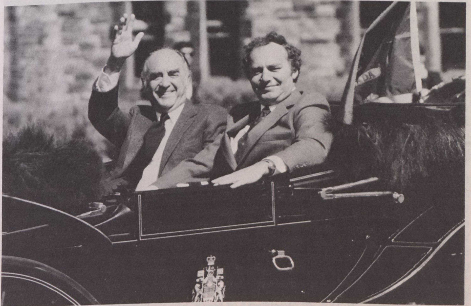
President Lopez Portillo arrives at the Parliament Buildings accompanied by Governor-General Edward Schreyer in horse-drawn landau.

The Prime Minister and the President announced that Mexico would guarantee delivery of 50,000 barrels of oil a day to Canada starting this December. These exports are subject to contractual agreements between Petroleos Mexicanos and Petro-Canada, expected to be concluded this August. The exports of Mexican petroleum to Canada are a central element of the Mexican contribution to the