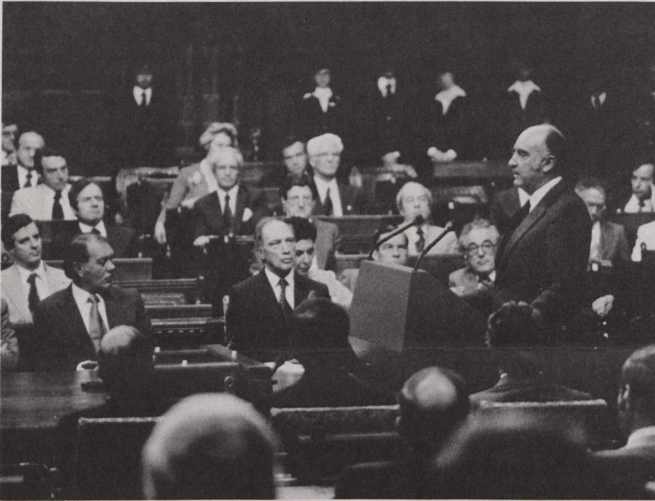
Prime Minister Pierre Trudeau (centre) listens to Mexican President Lopez Portillo address a joint session of the House of Commons and the Senate.

global scheme of co-operation between the two countries, said President Lopez Portillo.