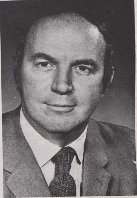
Finance Minister Donald Macdonald

Profits of Canadian-controlled private corporations eligible for a reduced rate of tax will be substantially increased. The annual amount subject to the low rate will be increased to $150,000 from $100,000 and the cumulative total increased to $750,000 from $500,000.