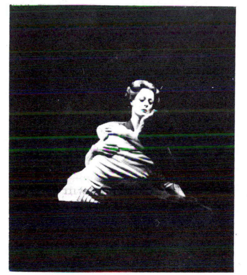
Antony and Cleopatra, are played by Keith Baxter and Maggie Smith.

four weeks. The box office opened March 8, and by April 19, $1-million worth of tickets had been processed. Unprocessed orders add another $500,000 to the amount, bringing the total, at April 19, to $1.5 million.