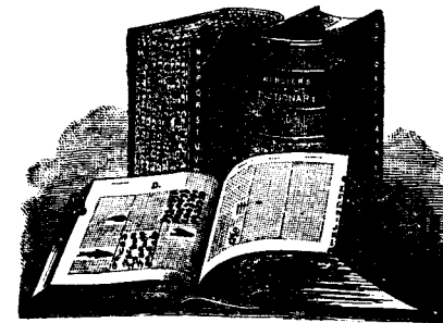
The latest issue of this work comprises