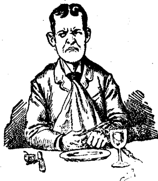
HE GOT RIGHT BY ME.

FUNK & WAGNALLS CO., Publishers, 11 Richmond Street West, TORONTO.