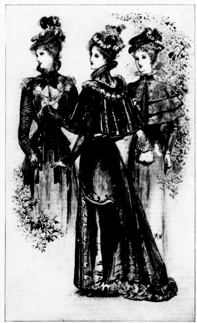
HATS, AND THE NEW SKIRT.

slim and slight, leaving no room either for stout people or for those who use the bicycle, and take much out-door exercise, for who could ride a wheel in a trailing skirt? An old-fashioned style of trimming revived is that of stitching flat bands of silk in a different colour from the dress. Thus a grey cashmere had bands of tartan silk, which were edged with a small galloon.