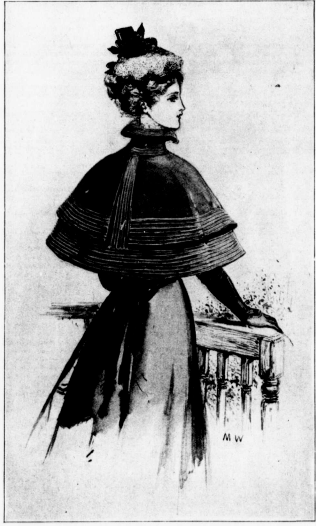
FLOWER TOQUE AND CLOTH CAPE.

Embroidered linens and cottons have also appeared for dresses, and they are, some of them, very pretty. Embroidered cashmeres and cloths are also seen, but are very expensive and require much silk lining to make them wearable.