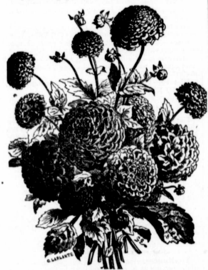
THE BISHOP OF DURHAM DAHLIA.

Lovers of handsome plants should secure a the selection of dahlias, than which no more handsome plant exists. The colours and shades of the different varieties include the bright and brilliant as well as the most delicate. The geometrical regularity of the flowers gives it the appearance of a large floral gem artificially cut in appearance of a large norm gem artificially cut in facets. Being tuberous rooted and somewhat tender plants, the seeds should not be sown until all danger from frost is passed. They require deep planting in moist rich loam, and