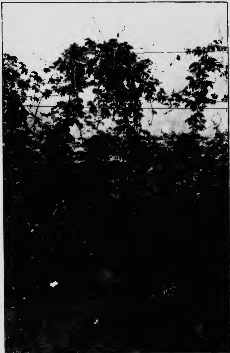
HOP FIELDS IN SUMMER, SHOWING THE TRELLIS AND VINES