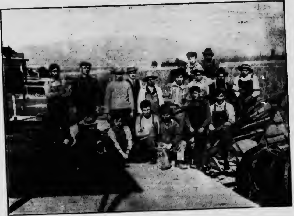
GROUP OF HOP PICKERS

without buying it too dearly. All branches of mixed farming are carried on by the Superintendent of the Experimental Farm, and records can be obtained for the last twenty years as to weather, crops, etc. At most times of the year there is work for capable people, in fact for years there has been a short supply of good men. The railway company employs men, the hop growers need men, the farmers need men nearly all the year round, and the Government farm needs men. There are openings also for young women who would work as helpers in the homes of the district, and they would obtain good wages and be well and kindly treated. The educational side of life has not been forgotten here. There are schools which are free under Government control, non-sectarian, in all parts of the district, and a higher school for those who wish to give their elder children an advanced education. We have a branch of the Bank of British North America here, one of the oldest chartered banks in Canada, where all financial business with the outside world can be transacted. There is much