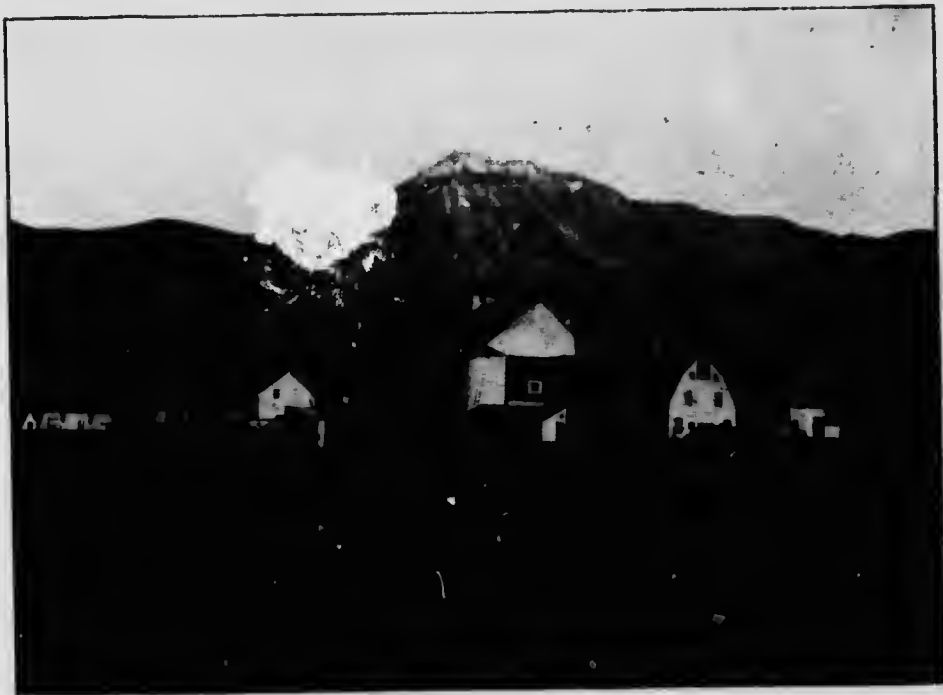
EXPERIMENTAL FARM BUILDINGS AT AGASSIZ

The Dominion Government Experimental Farm has been established here, giving new settlers every chance to get experience