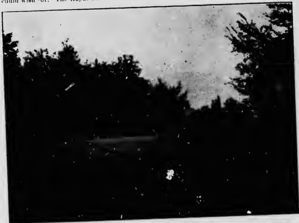
THE PRETTY LITTLE PARK AT AGASSIZ STATION, MAINTAINED BY THE HOTEL BELLA VISTA

Any information about the district, price of land, stock, employment, homemaking will be cheerfully furnished by the Secretary of the Agassiz Board of Trade. Address P.O., Agassiz.