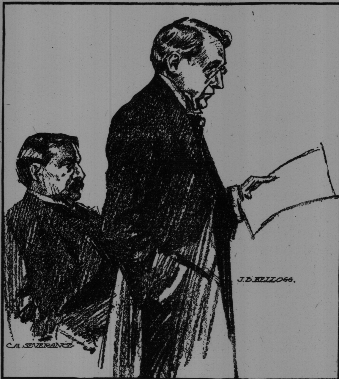
During the five hours which Mr. Harriman spent in the witness chair on the first day of the inquiry, Attorney Kellogg brought out an amazing story of high finance spent.

New York, Feb. 26—After amazing his listeners with the complete story of the celebrated Chicago and Alton Railroad reorganization, which netted millions to him and his associates, E. H. Harriman surprised the members of the interstate commerce commission by refusing to tell what his individual holdings were of the original stock.