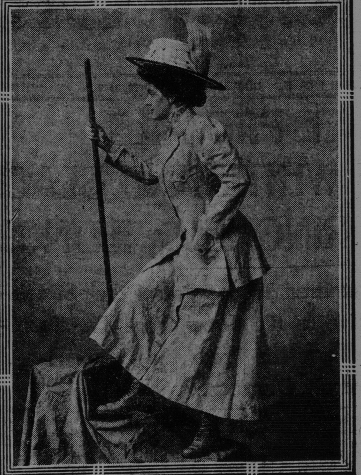
A SENSIBLE MOUNTAIN COSTUME.