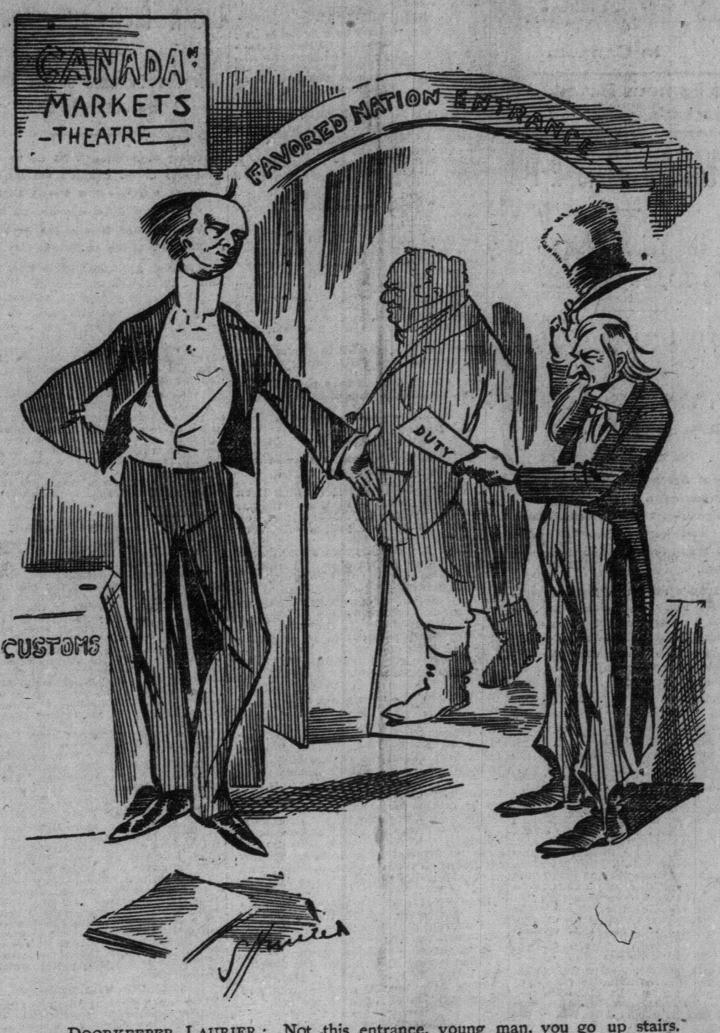
DOORKEEPER LAURIER: Not this entrance, young man, you go up stairs.