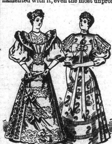
DINNER AND TEA GOWNS.

of silk or satin. I saw one gown for a young lady, though there was no train, made in this Everything is bordered or otherwise ornamented with it, even the most unprom-