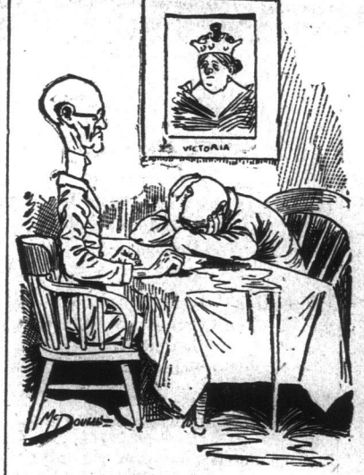
WEPT LIKE A CHILD.

my window is St. James' church. I can freely with him. window is open perfectly. This church ranged for him, also some cognac, a dip