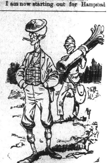
STARTING OUT TO PLAY GOLF.

Titled people of course may live as they choose, but they must not expect friends to fall in with their odd customs.