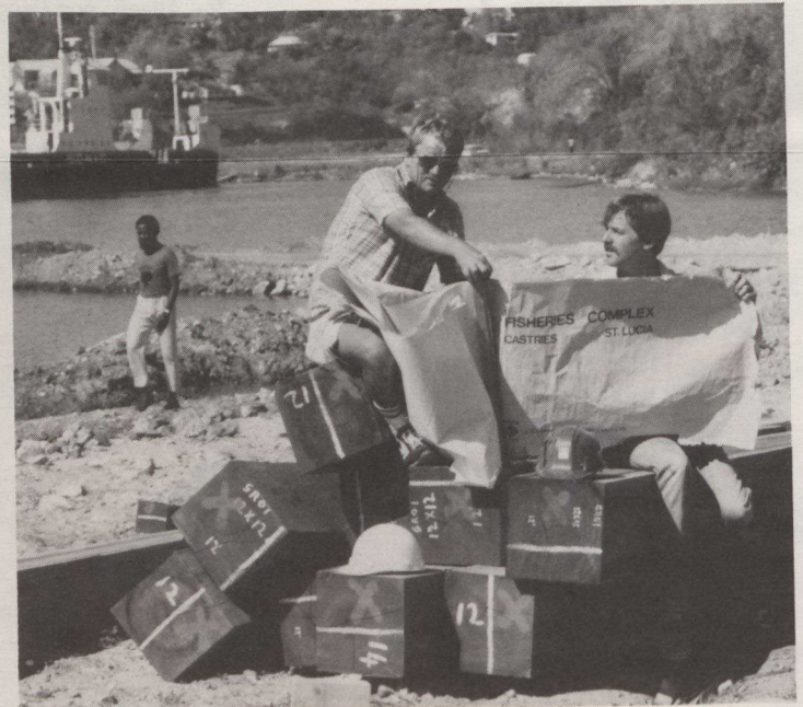
Canadian experts look over plans and supplies for the fisheries complex being constructed in Castries, St. Lucia, with aid from the Canadian International Development Agency.