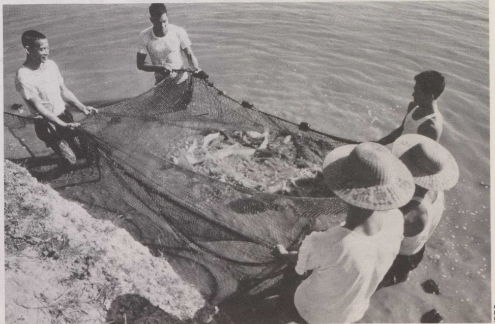
Traditional systems of aquaculture in China. Canada is very active in helping establish fish farms in many developing countries.

Cod is the biggest seller in foreign markets with 145 100 tonnes, valued at $396 mil-