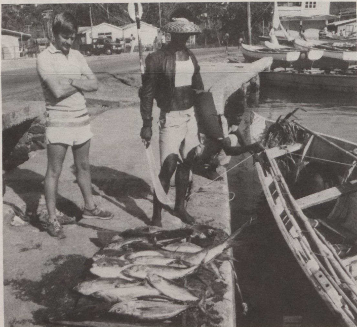
One of the Canadians participating in fisheries development in St. Lucia surveys the catch of members of the St. Lucia Fishermen's Co-operative Society.

St. Lucia is one country that has improved its fisheries base and has instituted training programs for management of its fisheries. CIDA helped St. Lucia to prepare a long-term fisheries development plan, and to construct a fish landing and processing complex. As part of the project, Canadian marketing specialists, a plant manager and other skilled personnel were sent to St. Lucia to provide assistance, and residents of that country