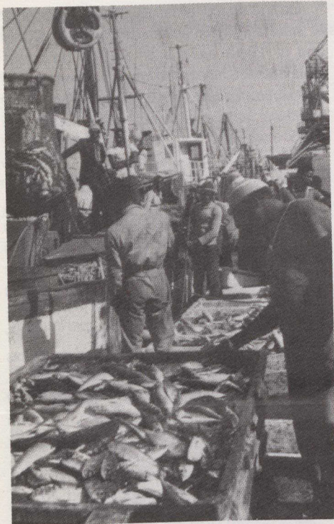
Unloading the catch from Senegalese boats. Canada is assisting Senegal to implement an improved management, packaging, storage and distribution system.