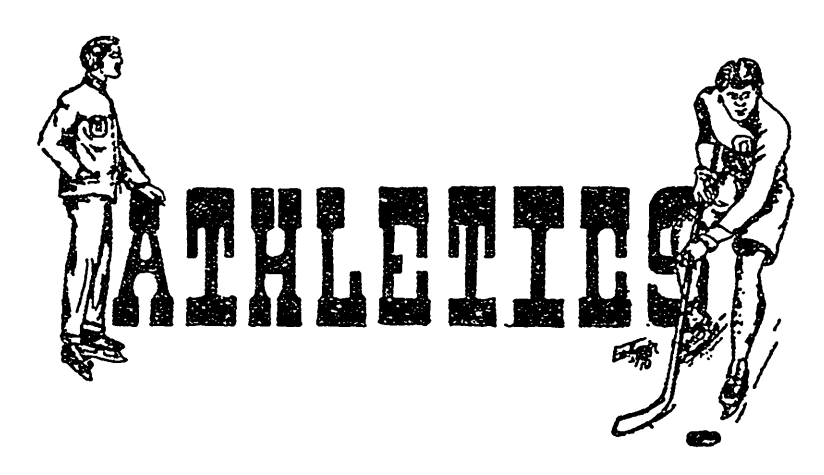
College (5) Stewarton (4).

College certainly put the stew in Stewartons, when they swamped the local all-star team on a sheet of hard ice, something for which the defeated team had long been clamouring. It was considered at one time that College were a soft ice team, but this idea has been disproved and the playing surface makes no difference to the local aggregation. They come, they see, they conquer.