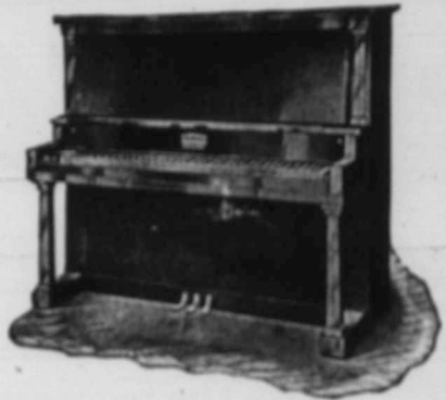
Style B Piano

ILL out and return the coupon to us at once, or, if you wish, drop us a card, stating that you saw our offer in this paper. We will immediately forward you illustrations of our several instruments, together with price on each. You pick out whatever Piano suits you best, notify us and we will forward it to you, freight prepaid, allowing you Thirty Days free examination and trial. If you don't want it, return to us at our expense and you are nothing out. If you do want it our prices are based on actual cost to produce, with no commissions for jobber and middleman.