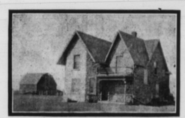
ne of Jan. Pro

cation by cable with all the exporting countries. All crop information, from whatever part of the world, is directed towards these centres. A dealer in London or Liverpool learns each day at what prices the Chicago or Winnipeg markets opened, the condition of the weather in the western States, Canada, the Argentine or Australia; how many cars of wheat were received in Minneapolis, Duluth, Winnipeg; the crop conditions in Argentine, whether it is raining or the sun shining, whether it is raining or the sun shining, whether wheat is being freely marketed or held back; from Russia comes the information as to the development of a strike on the docks at Odessa (a very common occurrence) the amount ment of a strike on the docks at Odesia (a very common occurrence) the amount of wheat in stock at Black Sea ports; from India he gets daily news of the latest drought, while the cable tells him of Australian crop conditions. So that the British importer of wheat who does business on the "Baltie" of London or the "Corn Exchange" of Liverpoot, every business day of the year, has the centre of all information of wheat crops and everything pertaining to them and this information radiates to the importing