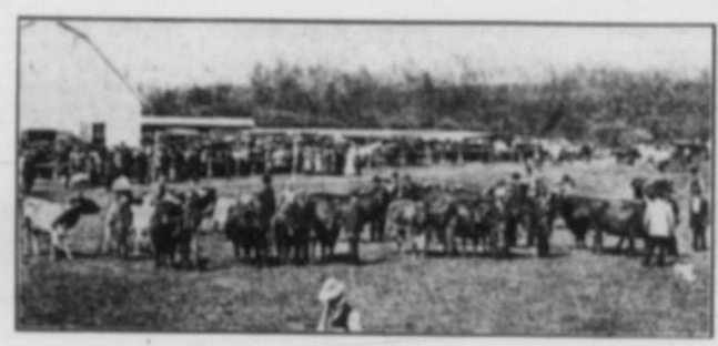
il (Alta.) Stock Show, 1910

to the same consideration as any other speculator on the wheat market, and because of its backing it occupies a very strong position on the market. But it sells futures against a fall in the market and buys against a rise, and it engages in this business upon false pretences, pleading the interests of the farmer for its private gain. That is very nice so long as the market is amenable, but markets have been known to go the wrong way. An organized Patten playing upon sentiment for capital may be all right, but it is not exactly the kind of star which farmers should hitch their wagons to. "And there is reason to believe that the farmers are becoming familiar with the juggling methods of this particular concern. They are not saying much, but they are doing a whole lot of thinking. They have taken the measure of the Grain Growers' Grain Company and the journalistic balloon which it employs to kite its somewhat dubious commercial adventures."