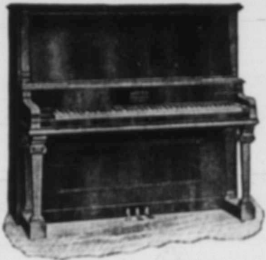
Style A Piano

Pianos direct from our Factory to your Home