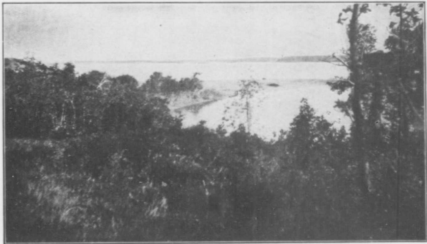
GLEN HARBOUR—LAST MOUNTAIN LAKE