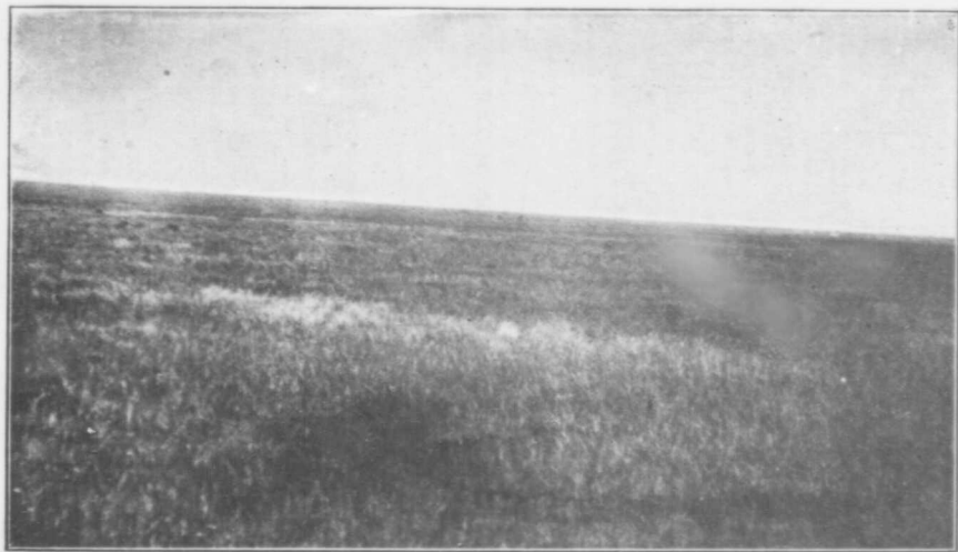
PRAIRIE IN LAST MOUNTAIN VALLEY