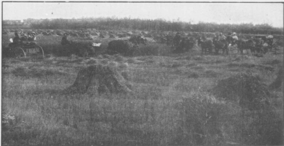
HARVESTING SCENE ON THE PRAIRIE