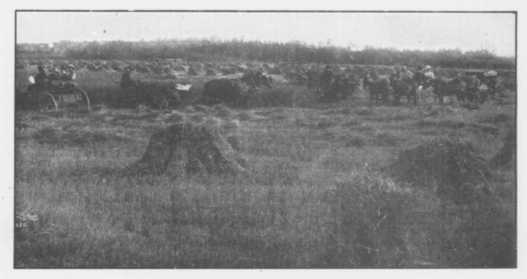
HARVESTING SCENE ON THE PRAIRIE