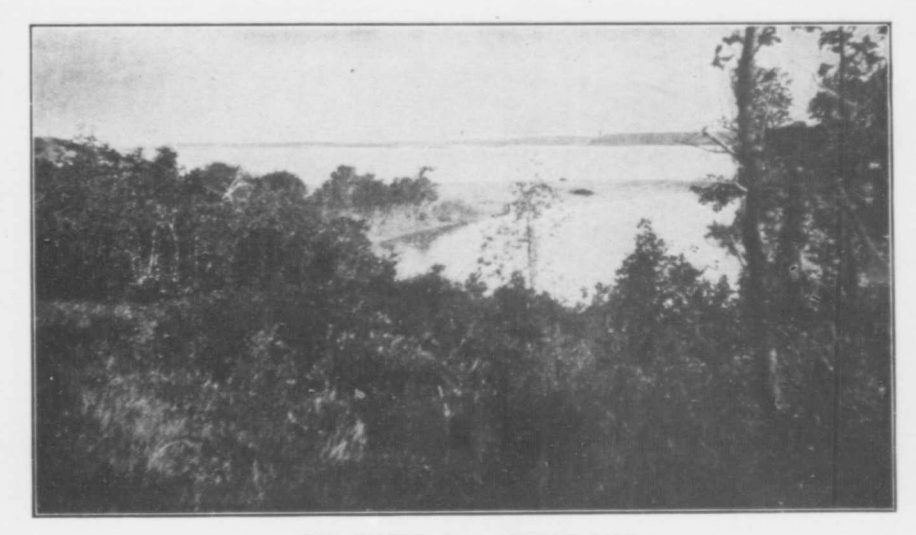
GLEN HARBOUR-LAST MOUNTAIN LAKE