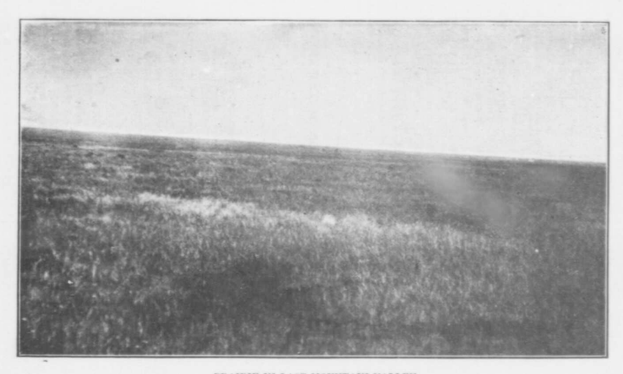
PRAIRIE IN LAST MOUNTAIN VALLEY