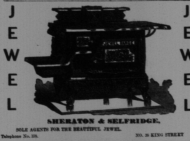
SHERATON & SELFRIDGE. SOLE AGENTS FOR THE BEAUTIFUL JEWEL. NO. 3 KING STREET.

WELSH, HUNTER & HAMILTON. We have just received a large and beautiful assortment of Lace Curtains to which we invite the special attention of the Ladies.