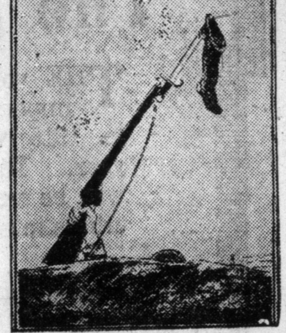
The Toronto "Sox Day," Feb. 15.

Have you taken up the slogan, "Sox for Soldiers" and joined the World "Sox Day" fund campaign? If not, will you join now by donating a pair of socks and help the cause along?