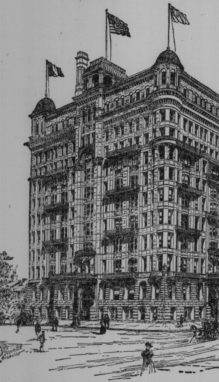
Temple Building as it New Looks, With New Upper Storey.