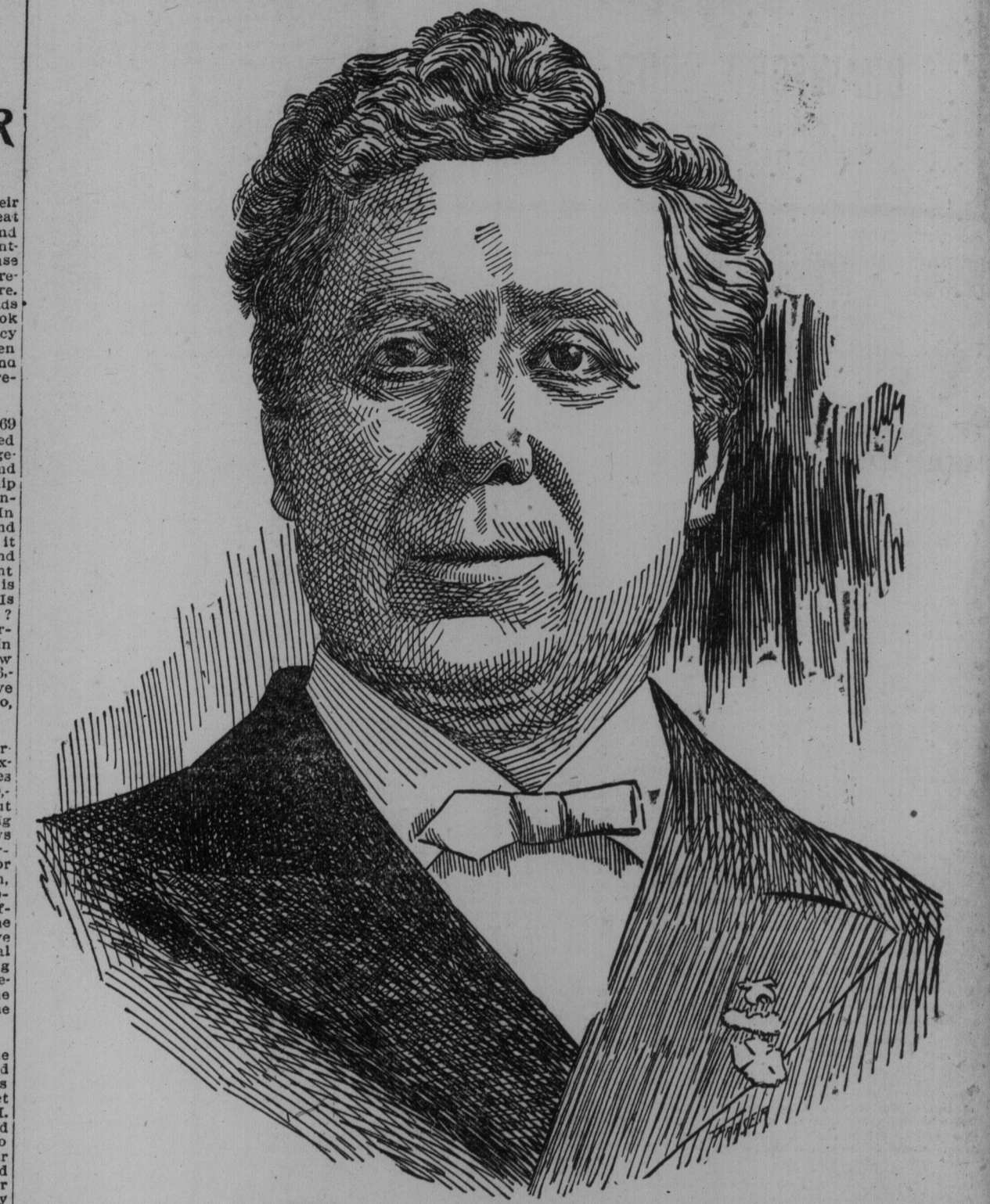
Thru Whose Indefatigable Labors the I. O. F. Owes Its Present Exalted Position.

THE HEAD OF THE ORDER. Sketch of the Remarkable Life of Dr. Oronhyatekha. Dr. Oronhyatekha has had a career nothing short of marvelous. The following article by a well-known writer appeared in the Canadian Magazine some time ago, and it gives one a splendid idea of the man, as he is to-day—the head of one of the greatest fraternal insurance companies in the world. It has been said that the most important movements in the progress of humanity are controlled by some strong personality, and that, in spite of the assertion of philosophical students to the contrary, the effect of the individuality of the leader is often exaggerated and that the great changes which society has made would have come in some form at all events, with or without the one whose name has been made great thereby. Nevertheless it is for the most part true that history is a series of bio-