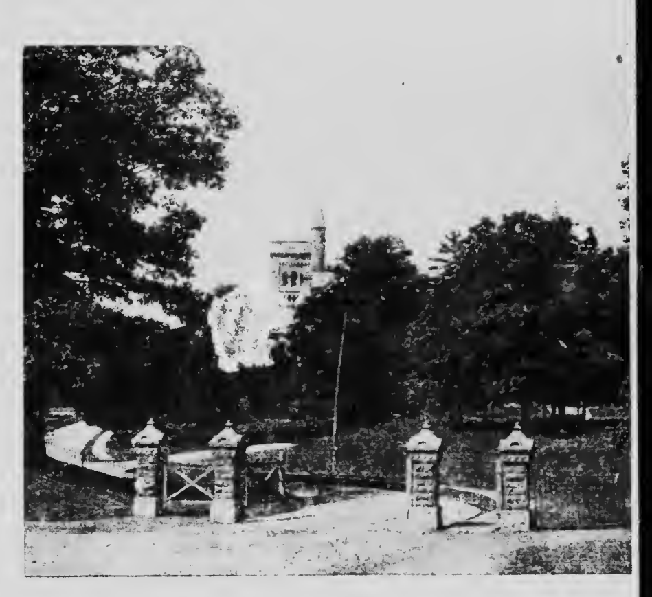
PASI CATE TO UNIVERSITY GROUNDS.