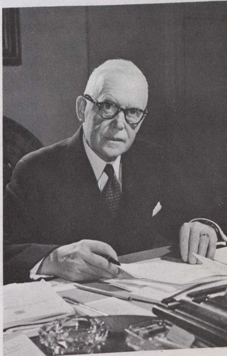
Louis Stephen St. Laurent

Canada is a better place because he lived among us — tribute to Mr. St. Laurent