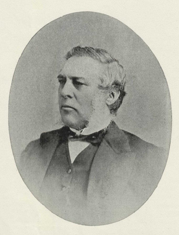
SIR JOHN CAMPBELL ALLEN LATE CHIEF JUSTICE OF NEW BRUNSWICK.