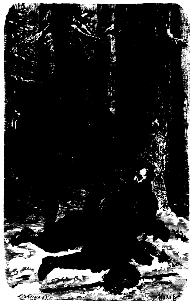
A SAMARITAN OF THE STEPPES.

He had reached his goal: a thousand miles of deadly suffering and danger lay behind him; he was on the shores of the White Sea, with vessels