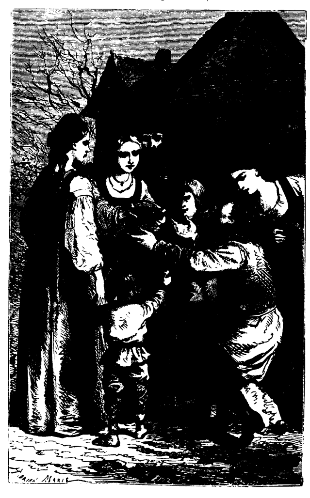
CHARITY TO THE EXILE.

homesickness,' replied the prisoner. 'O native country!' said the Russian, in a softened voice, 'how dear thou art!' After various official interviews he was taken to the governor-general's ante-chamber, where