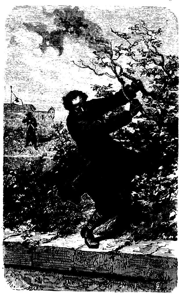
CROSSING THE FLONIIER.

she could ill afford; and as he was merely passing through the city and had his passport, there could be no harm in staying away. The next day, while wandering about the streets seeking a mode of escape,