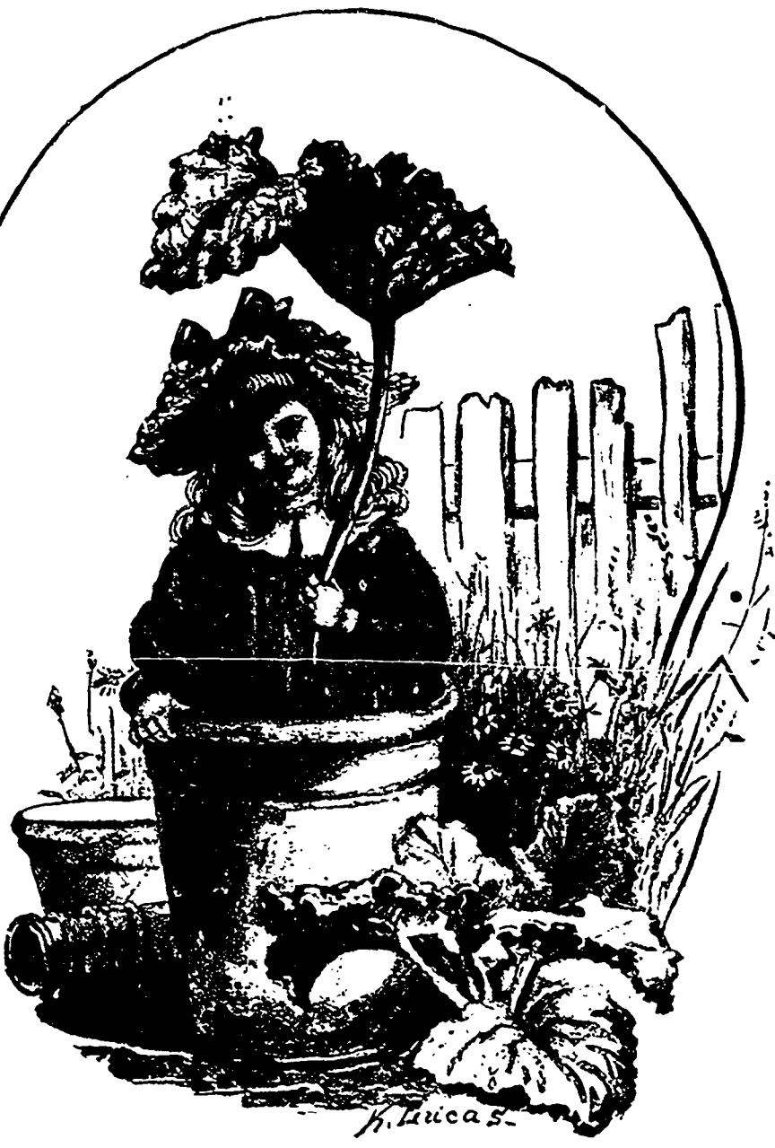
A STRANGE PLANT.

forward into the light of the fires, consentry to pass her in, and who looked as proud as if they were escorting a queen. The whole regiment gathered, including the colonel himself, to look at the child and