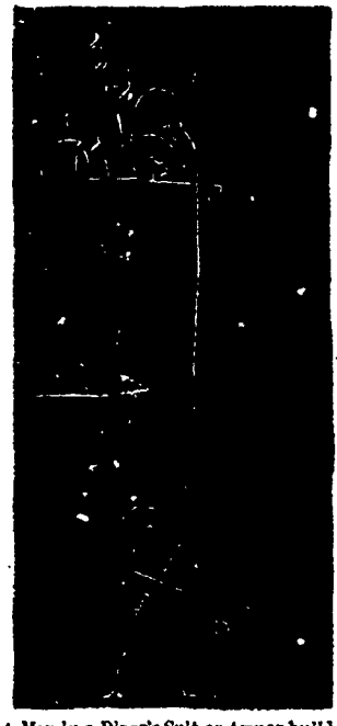
A Man in a Diver's Suit or Armor build-ing a Foundation under Water.

The diver simply puts on a peculiar kind of a suit made of Indiarubber, which completely covers him and keeps out the water.