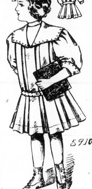
GIRL'S BOX PLEATED DRESS. No. 5910.—The box pleated modes are always popular for girls, the long lines being particularly becoming.