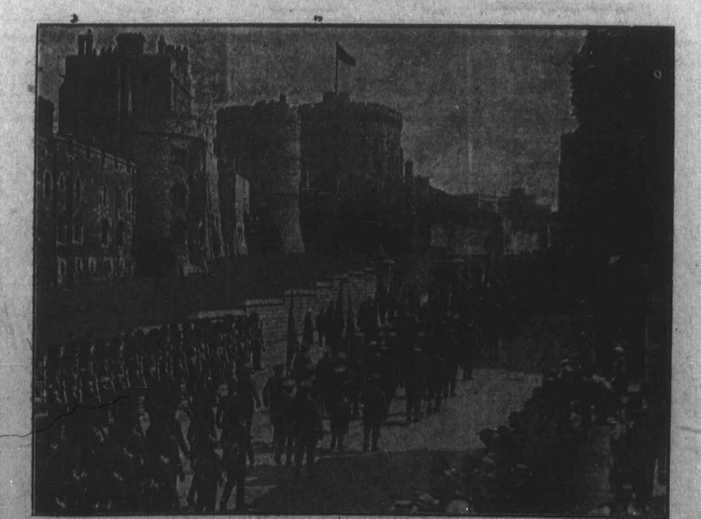
The King receives at Windsor Castle recently the colors of some famous Irish Regiments, whose disbandment followed the nition of the Irish Free State. The regiments whose deeds of valor in many lands are famous in British Military history of the Royal Irish Regiment, The Connaught Rangers, The South Irish Horse, The Prince of Wales Leinster Regiment (The Canadians). The Royal Munster Fusiliers and the Royal Dublin Fusiliers. The Photo shows the colors and escorts approximate the carelle.

THE KING RECEIVES COLORS FROM DISBANDED REGIMENTS