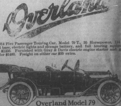
Overland Model 79

Send for catalog and full information to