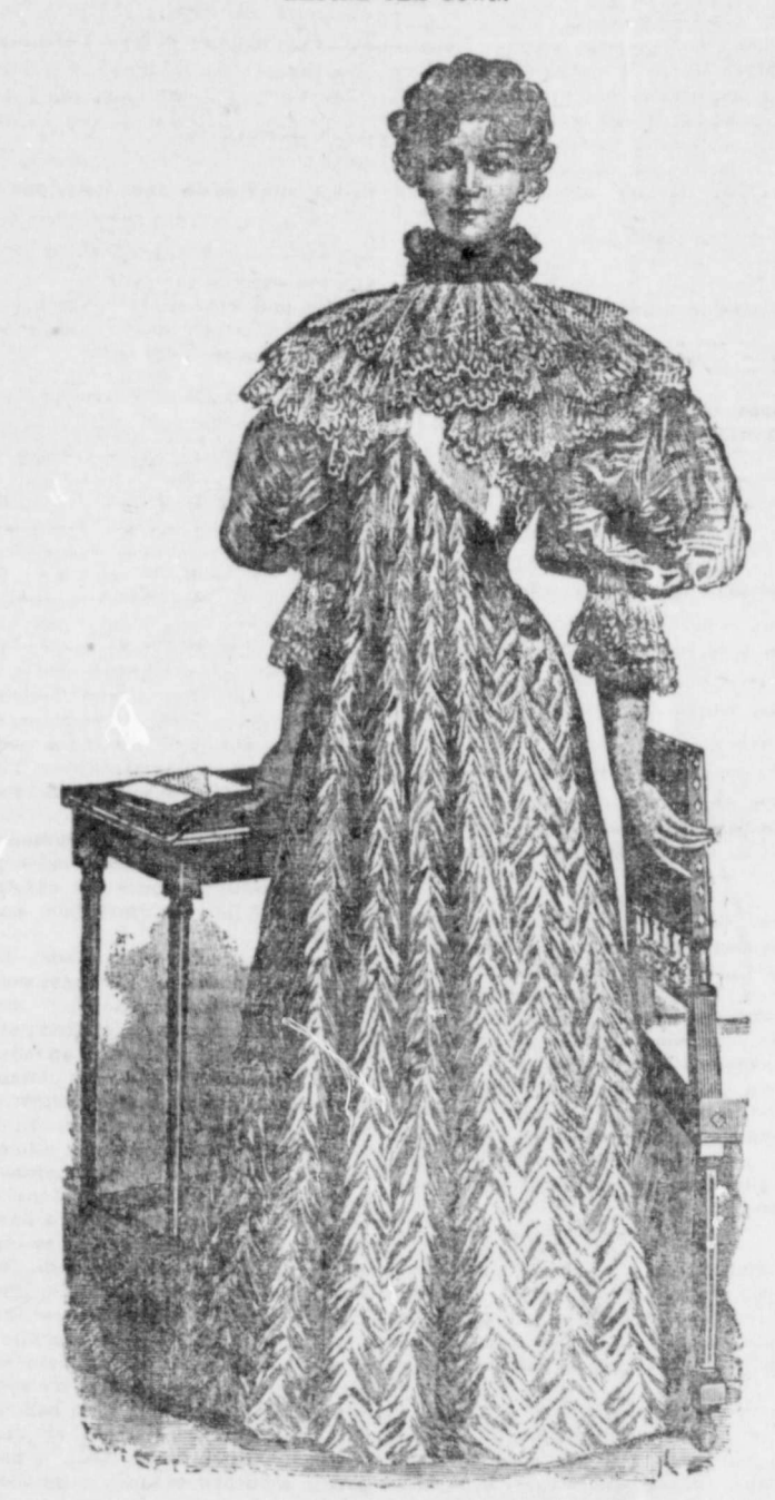
HELIOTROPE NOVELTY COSTUME.